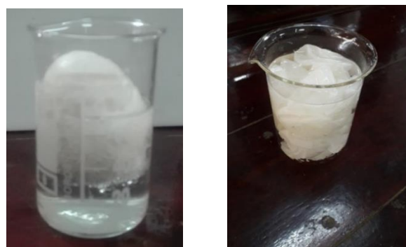
Figure 2: Preparation of semi-permeable membrane and prepared membranes

Semi permeable membrane was prepared from chicken egg by decalcifying outer shell and removing inner contents of egg. Apex of egg was punctured by a glass rod to remove the entire content. Empty egg shells were washed thoroughly with distilled water and placed in a beaker consisting 2M HCl (analytical grade, techno pharmache) for an overnight which caused complete decalcification. Then membranes were washed with distilled water and placed in ammonia solution for neutralization in the moistened condition for a while. Then they were rinsed with distilled water and Stored in a refrigerator at a pH of 7- 7.4 11 . Preparation of semi-permeable membrane and prepared membranes are shown in Figure 2.