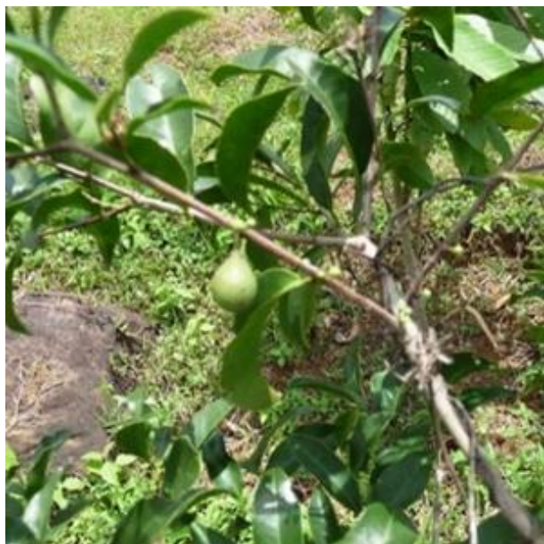
Figure 1: Plant Salacia reticulata

dried at room temperature and finely pulverized by using blender. Methanolic extract was obtained by using 200g of powdered stem and using 400ml of methanol (analytical grade, Merk specialties private Limited) in soxhlet apparatus until all the compounds were extracted in to the solvent. The extract was concentrated by using rotary evaporator at 40°C.